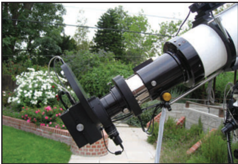
Image 3 - Left to right: FLI PL16803 camera, FLI CFW-5-7 filter wheel with Astrodon Gen 2 filters, Astrodon MegaMOAG off-axis guider with Starlight XPress Lodestar guide camera, Astro-Physics field flattener, FLI Atlas focuser, Astro-Physics AP206EDF refractor.

In order to get pinpoint stars all the way to the corners of the 52-mm diagonal 16803 CCD chip, I use the Astro-Physics field flattener that is matched to the 206EDF scope. There is a very tight spec ( \pm 1 mm) for the distance from the rear of the field flattener to the surface of the CCD, and properly calculating this distance requires taking into account the optical thicknesses of the filters and the CCD cover slip. Clearly custom adapters had to be made, and unless you are an expert machinist, there is no better source for such adapters than Precise Parts ( www.preciseparts.com ). Even with the help of their excellent website, deciding on the details of such adapters can be confusing, and I had to deal with an additional complication – off-axis guiding.