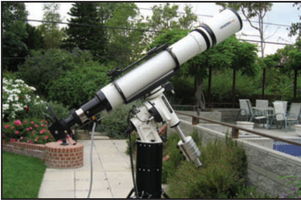
Image 1 - Imaging system built around Astro-Physics 206EDF scope and AP1200 mount on Particle Wave Technologies Monolith pier.

ambient temperature changes. Now it is clear why the 0.085-micron steps of the Atlas focuser are so useful.