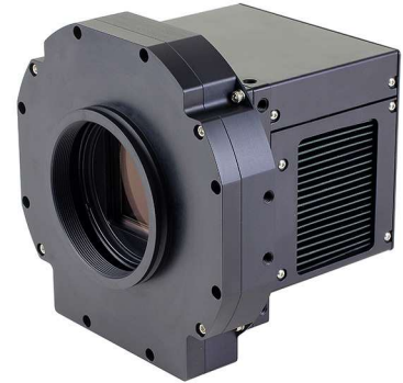
Shown with optional 65mm shutter housing