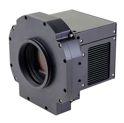
Shown with optional 65mm shutter housing