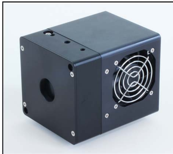
Shown with C-mount; other mounts available

At 3.7 x 3.7 x 4.8 inches the MicroLine is a small camera with big camera capabilities. Each component of the MicroLine camera is designed and manufactured for a long life in the most demanding conditions. MicroLine download speeds are fast yet maintain the 16-bit resolution necessary to produce high quality images. MicroLine cameras can achieve up to 60°C below ambient cooling without water assist. Simply set the MicroLine cooling where you want it and the camera will do the rest, quickly and without worries.